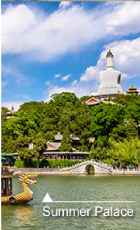
▲ Summer Palace

Its highlight is the Hall of Prayer for Good Harvests (祈年殿), an icon of Beijing City. Other attractions include Imperial Vault of Heaven (皇穹宇), and Echo Wall (回音壁).