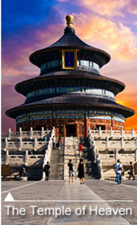
▲ The Temple of Heaven