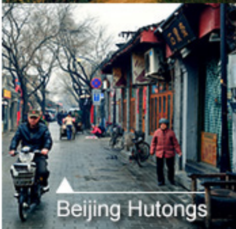
▲ Beijing Hutongs

There is a flag-raising ceremony at sunrise performed by the People's Liberation Army of China, and many Chinese tourists are there to see the performance. You can get up early to see the flag-raising ceremony, which is a sacred moment.