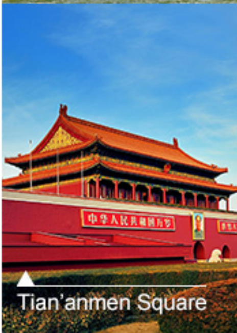
▲ Tian'anmen Square

Must-see attractions within Summer Palace include the Kunming Lake-the highlight in the palace, Longevity Hill, where you can overlook the whole Kunming Lake and Summer Palace, and South Lake Island accessible by ferry on Kunming Lake. Exploring this palace could have many funs .